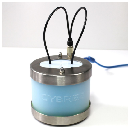
Fig. 1. CYBRES EIS differential impedance spectrometer.

The integrated thermostatic system utilizes two channel digital PID controller with multiple temperature sensors. The MU EIS is thermostabilized on PCB level. The system features internal 3D accelerometer/magnetometer, energy independent real-time clock, EM power meter (optional), humidity/pressure sensors (optional) and voltage sensors for monitoring environmental conditions during long-term experiments. USB interface is used for data transfer and for powering the device. Digital I/O lines are galvanically isolated. All data are recorded in real time and can be stored in the on-board flash memory with time stamps.